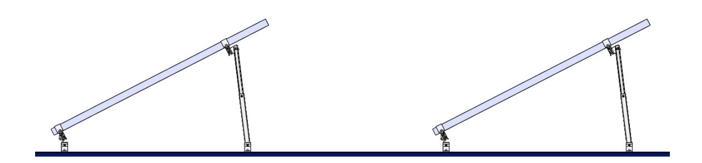
15-30° adjustable mounting